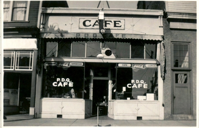
P.D.Q. Café - North Vancouver 1938 SE.101